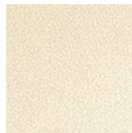
Cotton Club 111