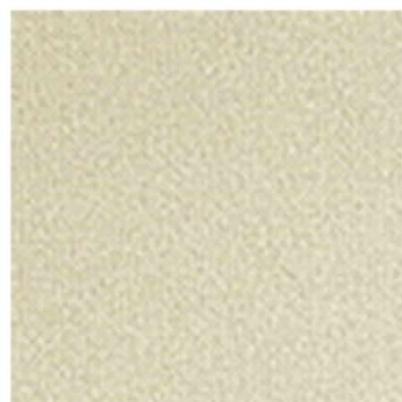
Cotton Club 101

Composizione 70% Cotone - 10% Poliestere - 10% Acrilico - 10% Altre Fibre