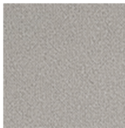
Cotton Club 106