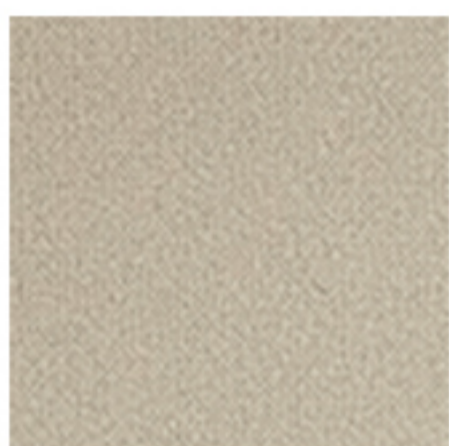
Cotton Club 113