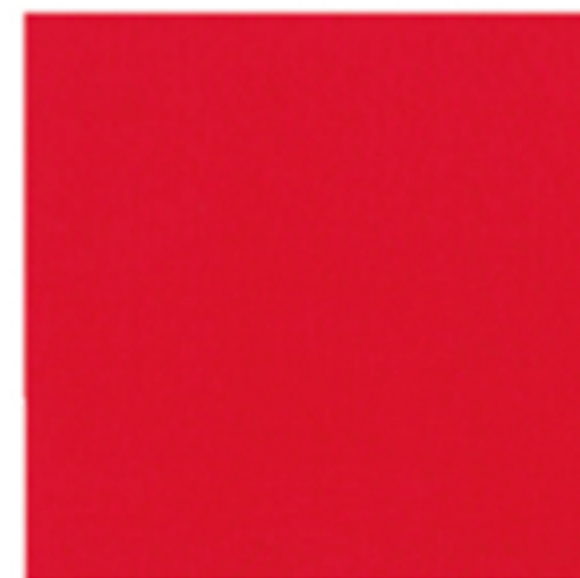
129 - rosso scarlatto