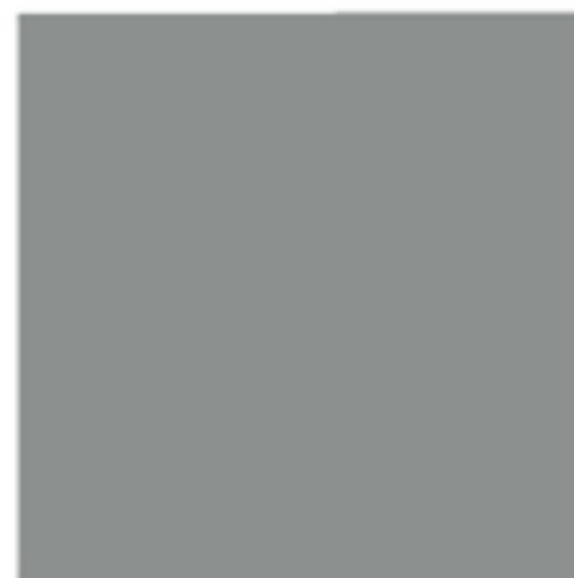
126 - grigio silver