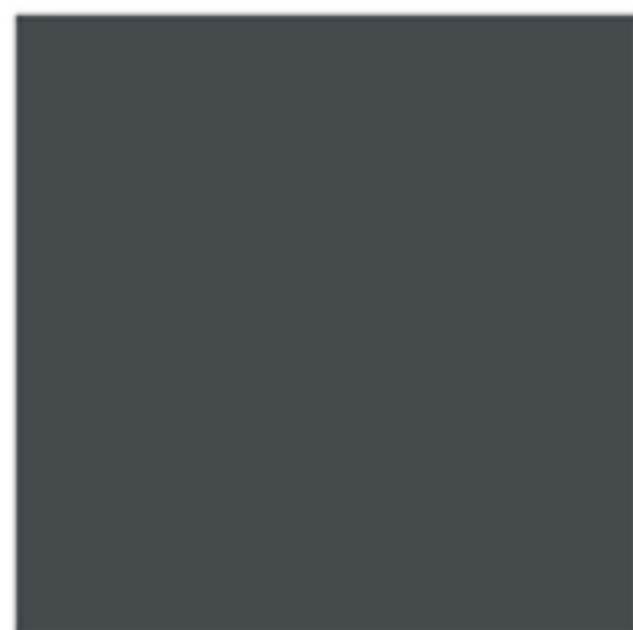
120 - grigio antracite