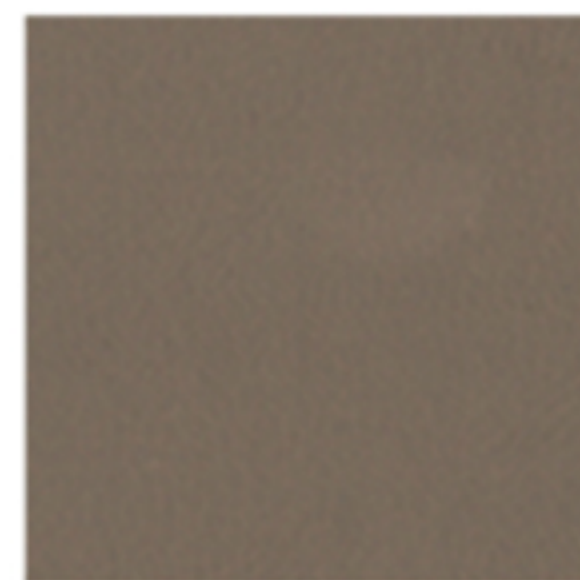
113 - grigio fango