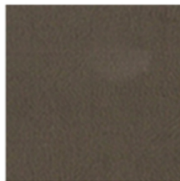
110 - marrone caffè