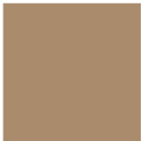
118 - beige tortora