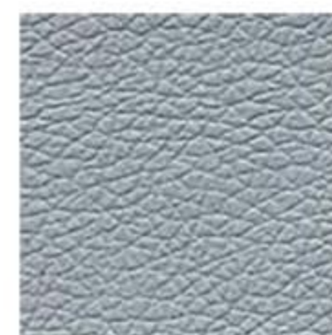
TRP03 - Grigio