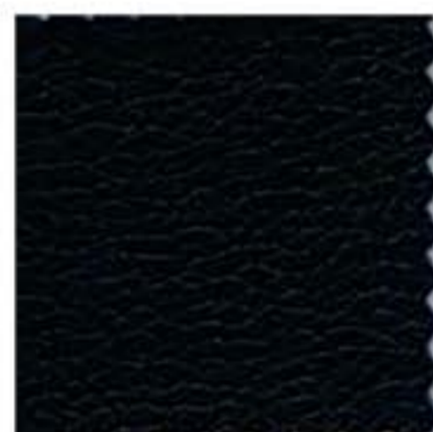
TRP01 - Nero