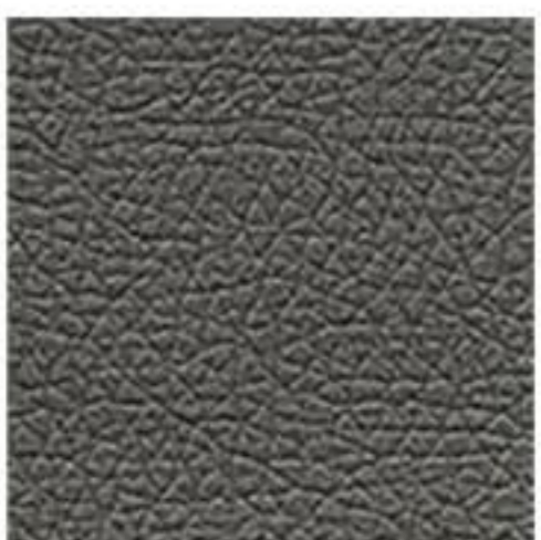
TRP05 - Fango