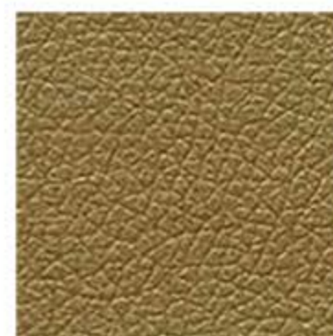
TRP11 - Oro