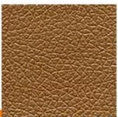
TRP13 - Bronzo Dorato