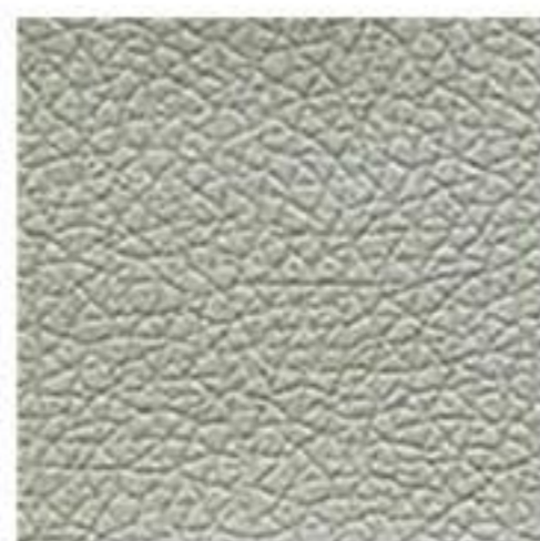
TRP06 - Sabbia