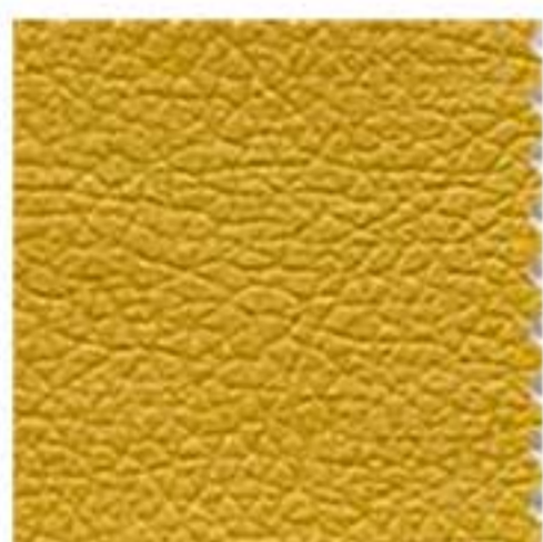
TRP09 - Curry