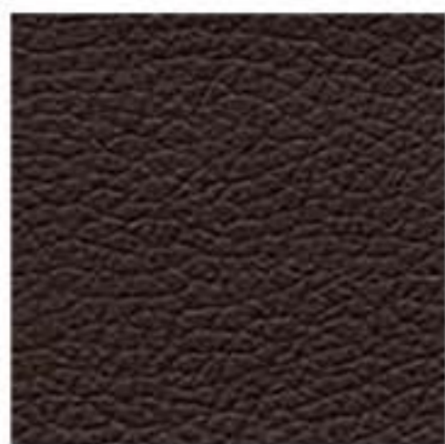
TRP07 - Cioccolato

Composizione 68% PVC - 2% poliuretano - 30% Cotone - Ignifugo