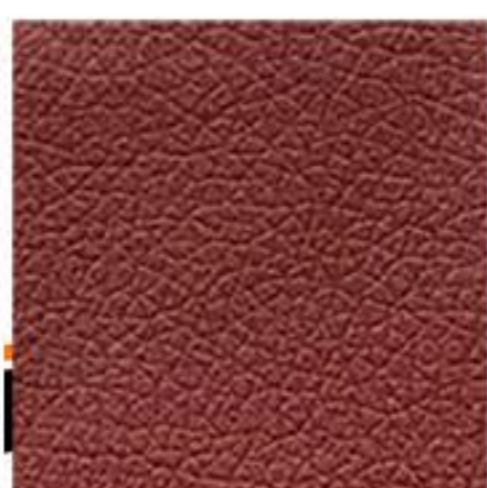
TRP17 - Mogano