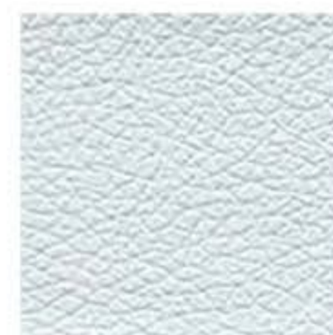
TRP04 - Bianco