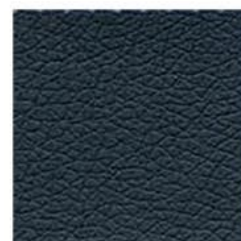
TRP02 - Antracite