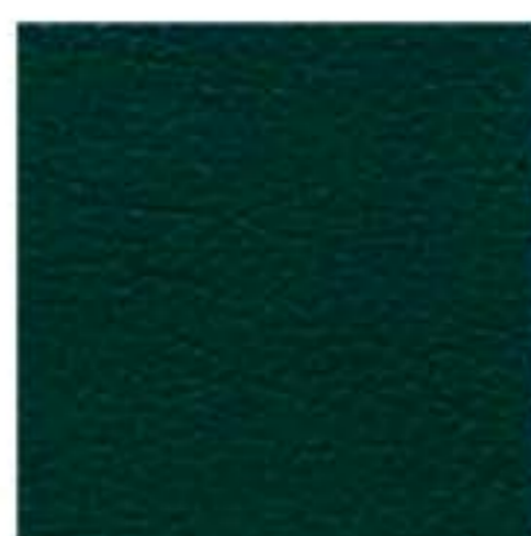
TRP18 - Verde Bosco