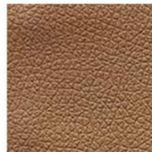
TRP08 - Biscotto