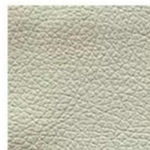
TRP12 - Beige