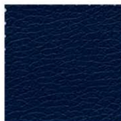
TRP15 - Blu