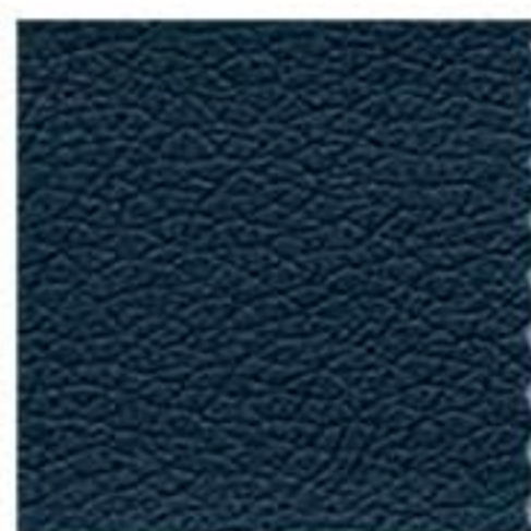
TRP14 - Avio