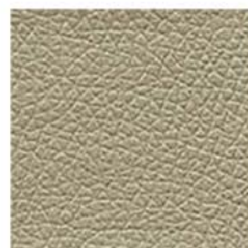
TRP10 - Grano